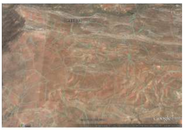
Figure 9. The mapped malle that he in the vicinity of Di-Heri