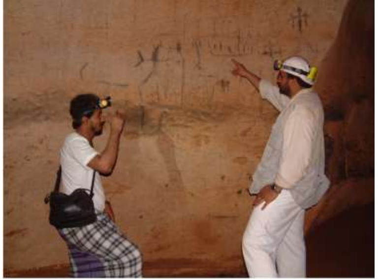
FIGURE 2. The southern panel showing the geometric patterns, vessels, and crosses