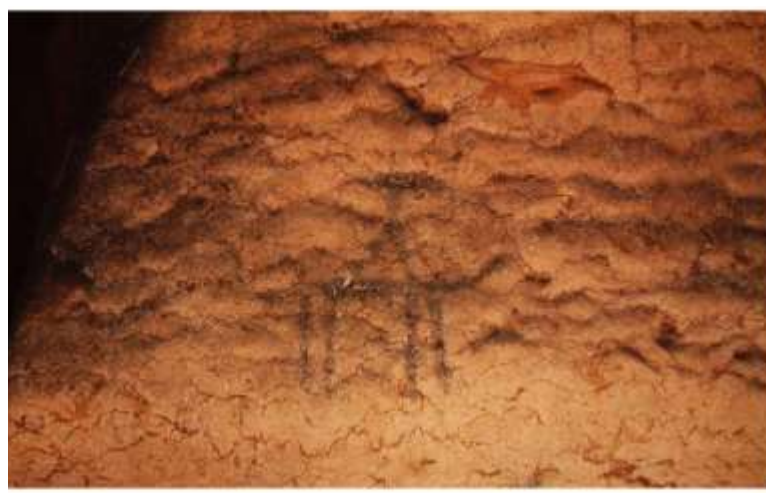
FIGURE 7. A close-up of the Arabian camel and rider.