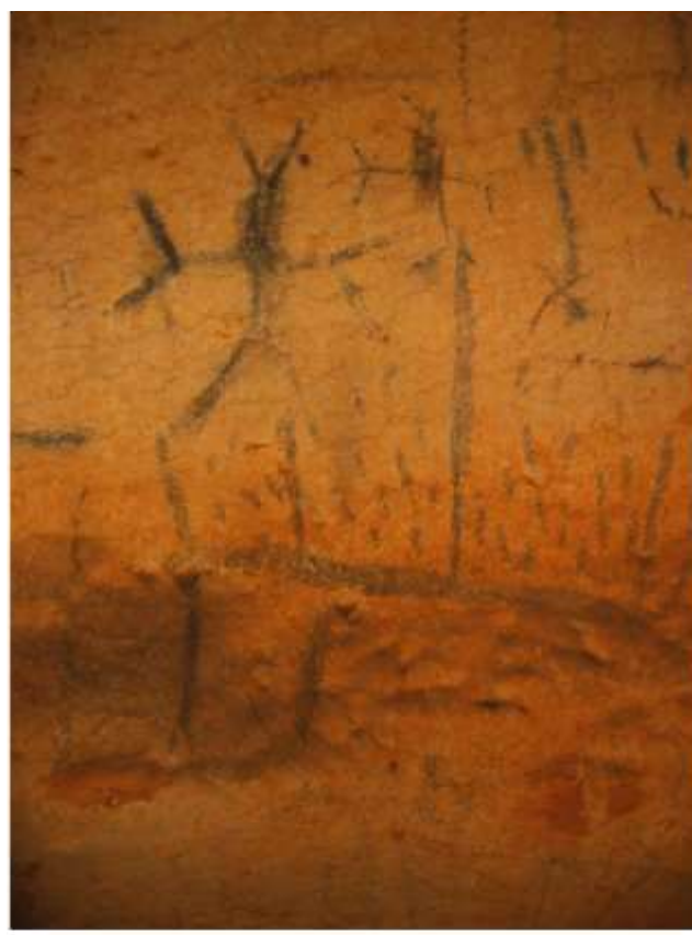
FIGURE 4. A close-up image of an antlered person or a cross fourchee; note the large three-masted vessel with the lines extending from the deck.