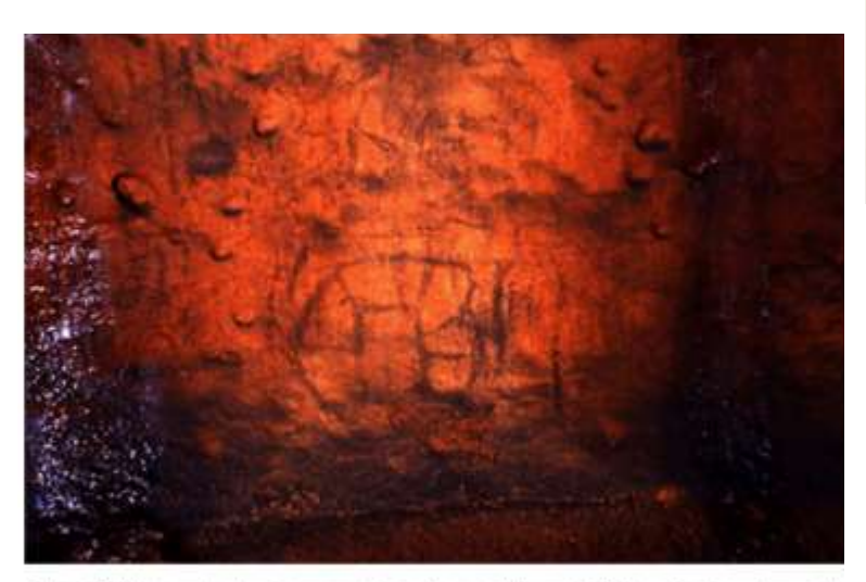
FIGURE 10. The circular drawing representative of a central 'farmstead' with outlying boundary walls.