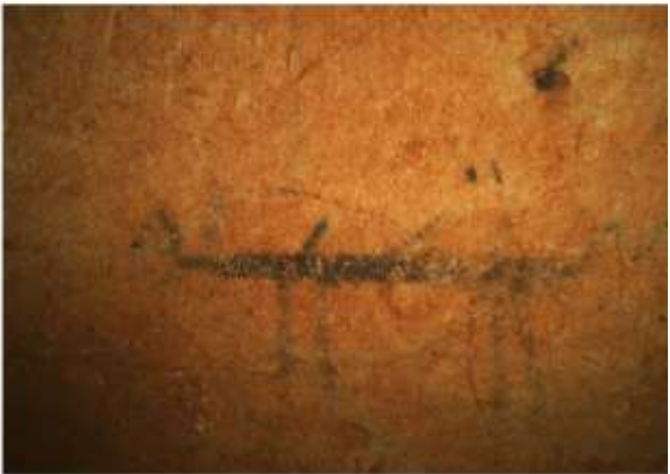
FRARE 3. An abstract image of a possible animal or insect.